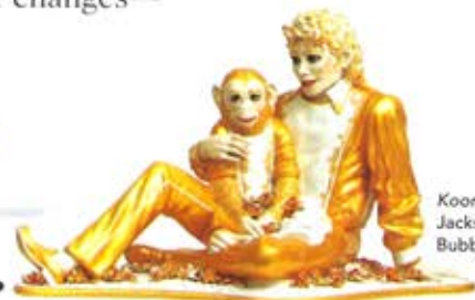
Koons's Michael Jackson and Bubbles, 1988.