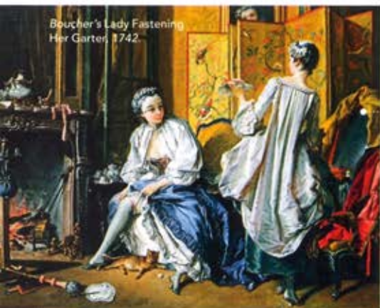
Boucher's Lady Fastening Her Garter, 1742.