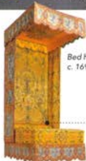
Bed hangings, c. 1690-1715.