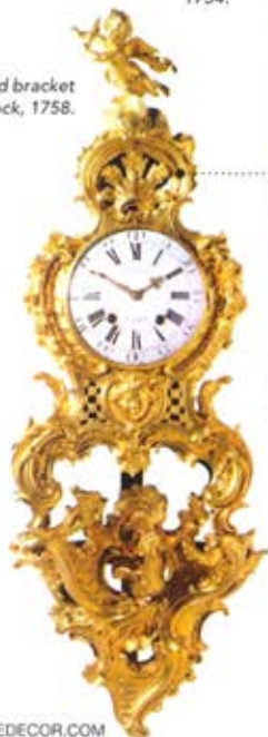
Gilded bracket clock, 1758.