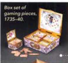
Box set of gaming pieces, 1735-40.