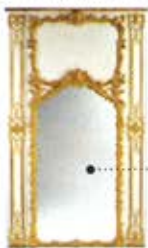
Mirror frame, 1751-53.